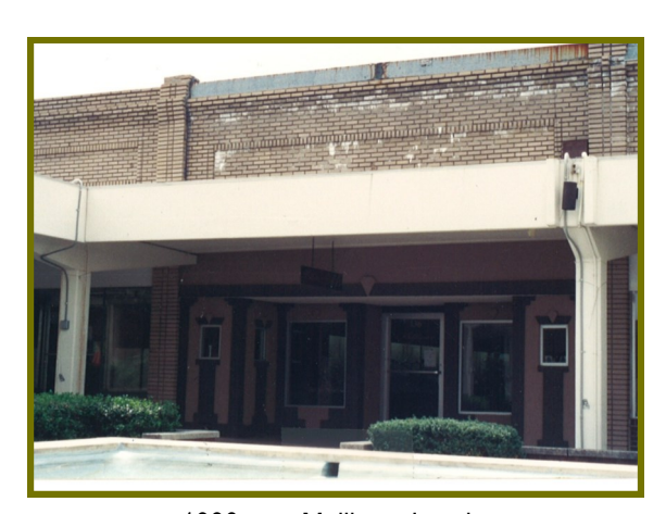
1990s, as Mullinax Jewelers

Today, the building is home to [ash-ling] booksellers, who have helped in the restoration of the façade and interior. The original transom windows for the building are still preserved and faintly show the Grooh's lettering.