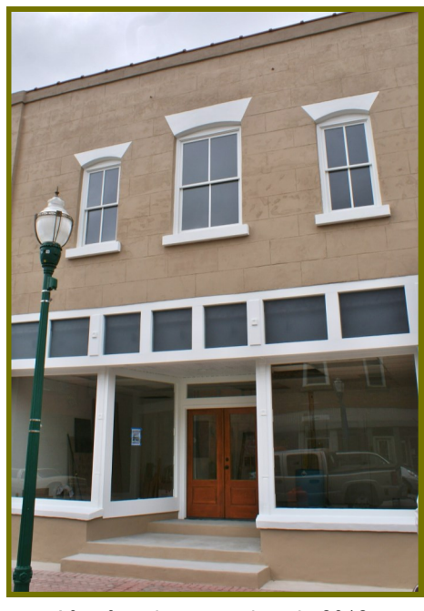
After façade renovations in 2012.