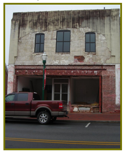
Before façade renovations in 2011.