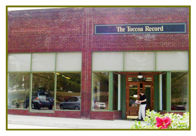
The Toccoa Record after façade renovations were complete.